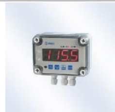
Wall mounted digital indicator