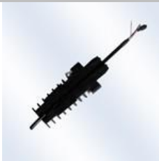
Cable support hanger