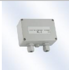
Cable Terminal Box with Vent